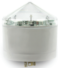
Locking Type (NEMA)